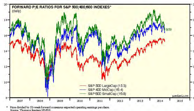
Figure 1: Forward P/E Ratios for S&P Indices

* P/E's divided by 52-week forward consensus expected operating earnings per share.